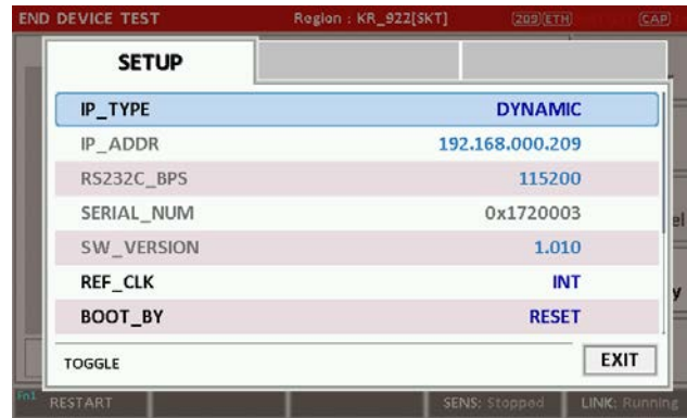
[Figure 2] SETUP screen of RWC5020A