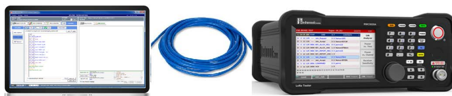
[Figure 1] Connection between PC and RWC5020A

Connect PC and RWC5020A with cross LAN cable.